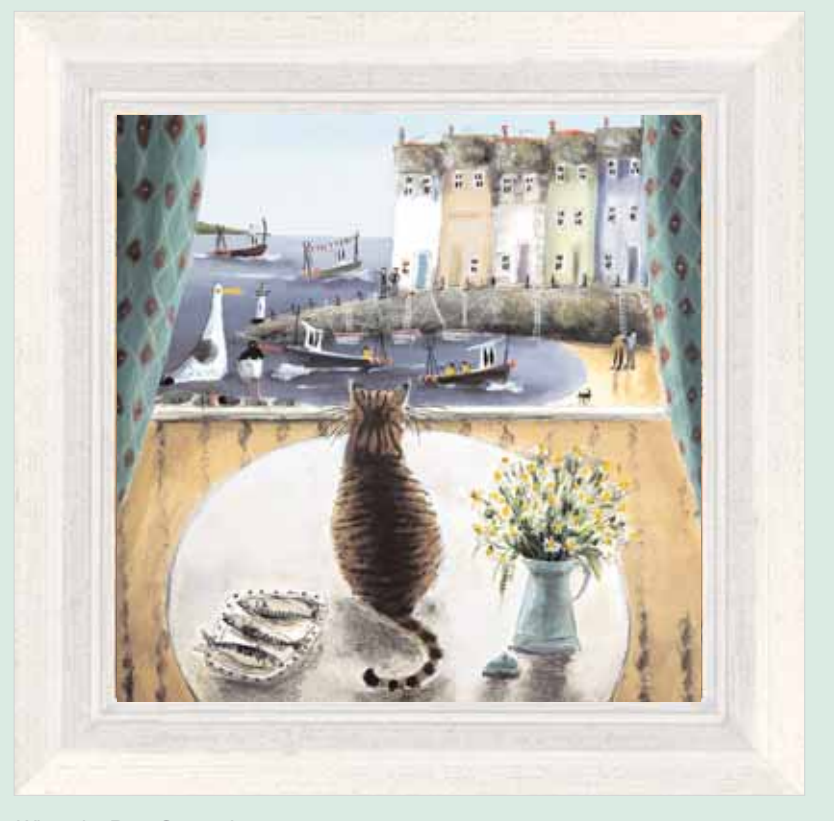
When the Boat Comes In

Canvas Edition • Edition Size 195 • 16" x 16" • Framed £280 Paper Edition • Edition Size 195 • 11" x 11" • Framed £185