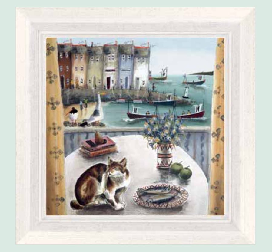
A Room With a View