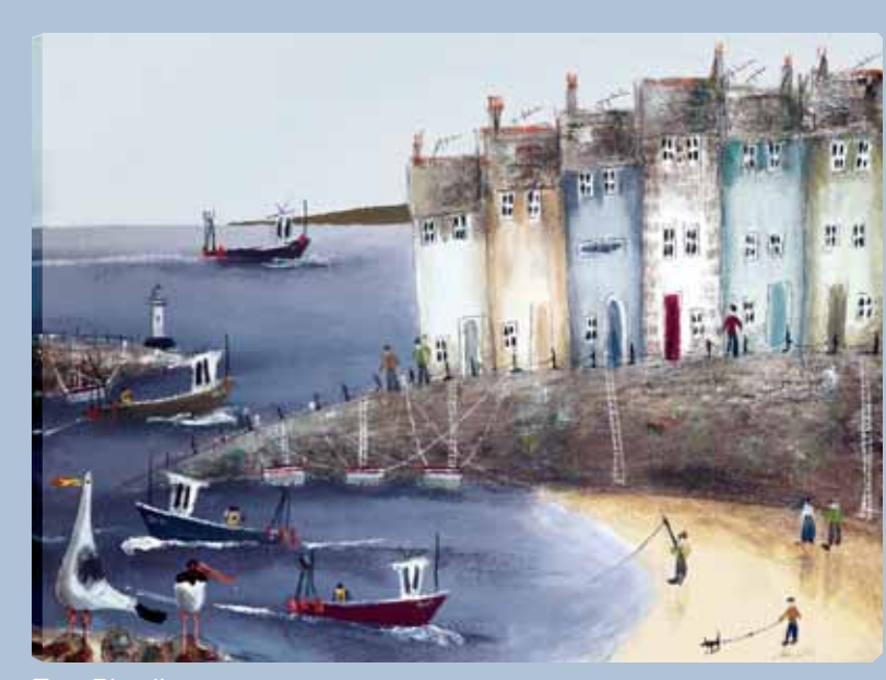
rue Blue II