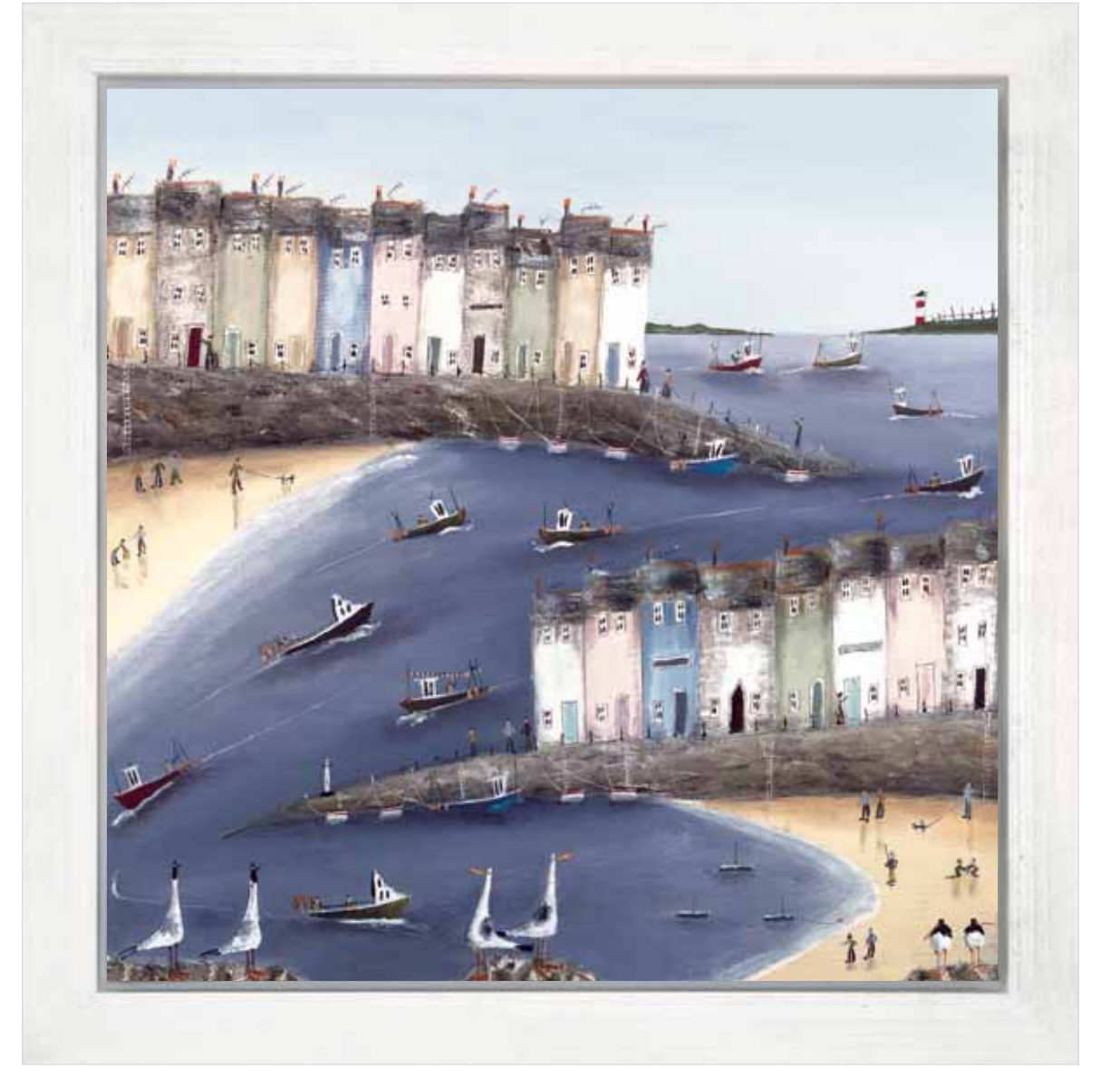
Home's Deep Waters • Box Canvas • Edition Size 195 • 32" x 32" • £595 • Framed Option £715